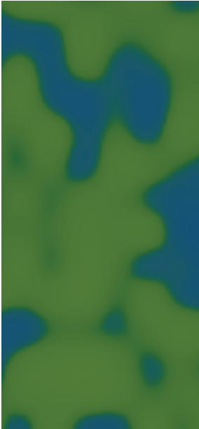
Fill Tool > Plasma