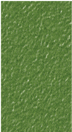
FX: Art Filter > Painting